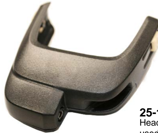
25-154075-01R Headset adapter, to be used with RMN5130A headset for PTT Express.