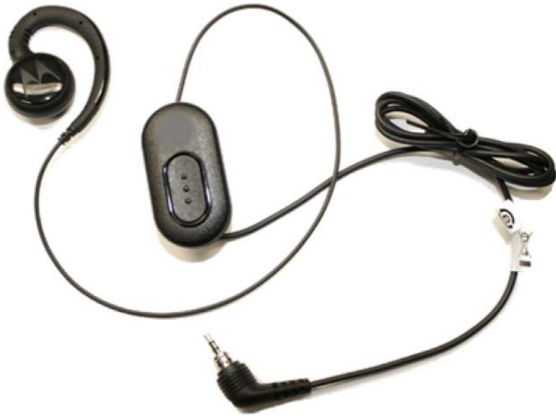
RMN5130A Mono over the ear headset W/MIC & PTT-2.5mm