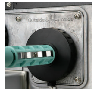
Automatic self adjustment for coated inside/outside ribbons