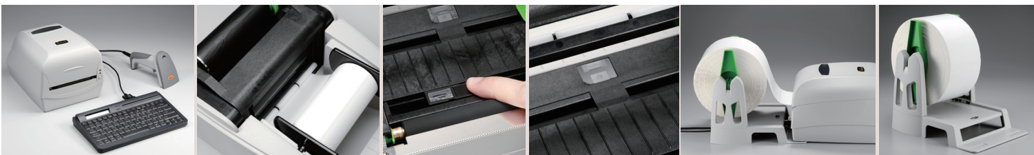
> Standalone mode with Argokee

The CP-3140L prints at a speed of 4ips and onto media of up to 50-inches in length. Standard memory includes 8MB Flash and 8MB SDRAM. The printer's modular design simplifies maintenance. It supports 1D/GS1 Data bar, 2D/Composite codes, QR barcodes, and Windows TrueType font download. The CP-3140L provides high quality printing for applications that require enhanced printing of text and graphics. The new CP-3140L and CP-3140LE printers are space-saving, flexible, and delivers outstanding print performance.