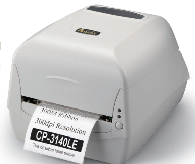
CP-3140LE 300dpi (Internal Ethernet)